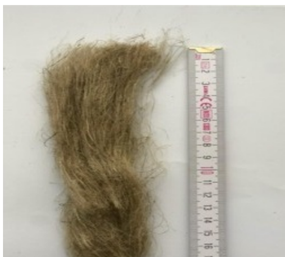
Fig. 1. Untreated hemp fibers

Primary bast hemp fibers ( Cannabis sativa L) were employed for fiber reinforcement (Fig. 1). Hemp fibers (cut to the length of 10mm – Fig. 2) were chosen as they are commonly utilized as fiber reinforcement in cementitious materials and have a lengthy agricultural history in Europe. Previous research reported the characterization results of hemp fibers (tensile strength up to 900MPa, density of 1500kg/m 3 , water absorption 100% after 120min) [7].