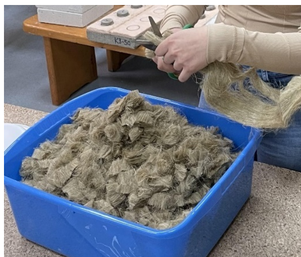
Fig. 2. Hemp fibers, cut to the length of 10mm