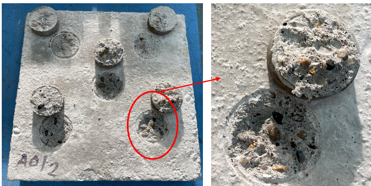
Fig. 4. Testing of pull off strength of concrete; a fracture in the concrete itself

Recorded fracture patterns are illustrated in Figures 4 and 5 and listed in Table 3.