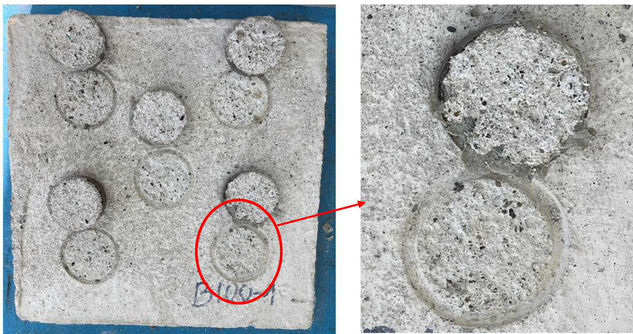
Fig. 5. Testing of pull off strength of concrete; a fracture at the concrete-glyce interface