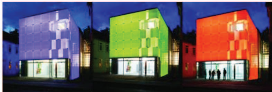
Figure 5: 2006: Museum of Art - Ahrens Grabenhorst Architekten BDA Hannover