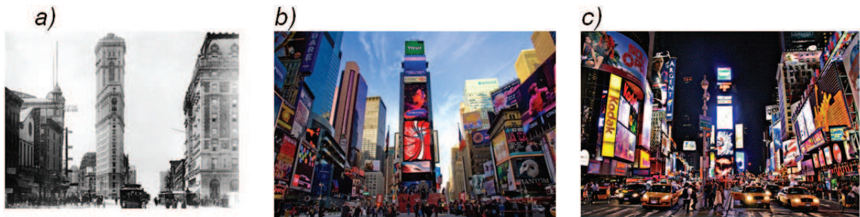
Figure 6: a) Times Square 1904 – before the era of media façades, b) Times Square – during the day, c) Times Square – during the night [19]

us to be in many places at the same time. The city becomes the scene for urban interactions of media façades, the place for virtual dialogue. Façades are treated like “building land” and collective action place. The relationship between the passer-by and envelope is no longer only physical and visual, but the place for emotional focus and interactive drama. These urban decorations cannot be treated as architectural solutions. Large screens (billboards) are not aimed at cultural and artistic awareness, but acquire strictly commercial characteristics, and become the means for demonstrating the power of gigantic corporations. Outdoor cinemas, large displays are treated like real estate, relocating the issues of everyday life into cyberspace. They represent the source of light pollution that is the product of light illuminations in cities.