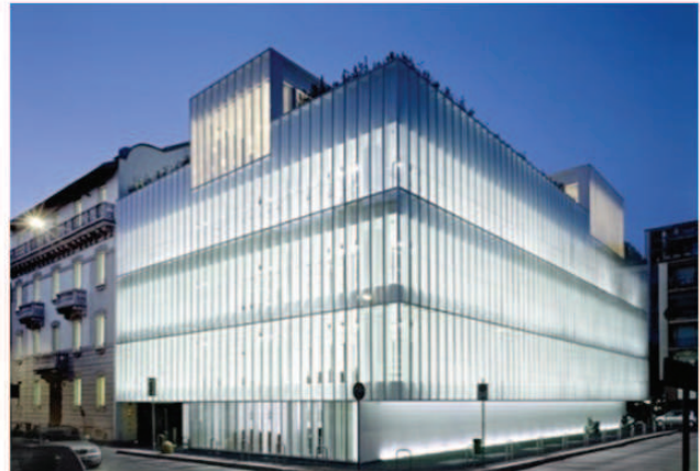
Figure 4: a) 2009: Moderna Museet Malmö - Tham & Videgård Arkitekter, Malmö, Sweden, b) 2006: Dolce & Gabbana Headquarters - Studio Piuarch, Milan, Italy

Achievements in the development of technologies and materials have encouraged architects in their conceptual programmes, so they have found a model for architectural works to exist during the night, by insisting on their dual nature and recognisability: during the day – by interesting volume, during the night – by light-transparent façade. Owing to the development of LED technologies, façade is now able to exist unobtrusively during the day, while during the night, when it is not possible to view urban environment, it is transformed into new spatial values. The permanence of change in the example of