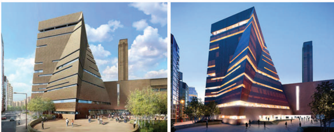
Figure 2: Proposal design for expansion of Tate Modern museum to officially open in 2016 - Herzog & de Meuron, London, UK