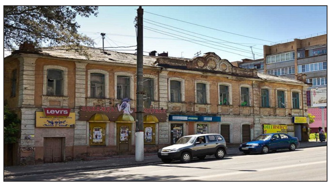
Figure 3: Trader Naumov's house

The guide for Kursk from 1902 [05] describes in details the central part of the city and architecture of its historical part. According to the guide in 1869 on the Red Square there was a municipal garden with alleys and roads set up for walking. The center of architectural composition of