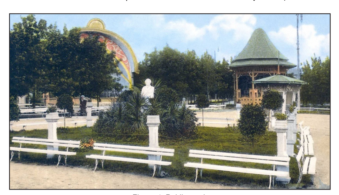
Figure 4: Public garden

the garden was the building of a fit-up, which gave performances and where people's readings were organized. On Figure 4 you can see the building of the fit-up in the public garden, and in the center – bust of A.S. Pushkin, set to celebrate the centenary of the poet's birth.