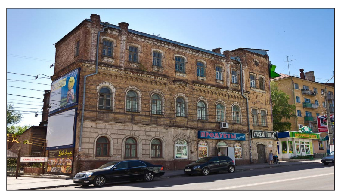
Figure 2: Trader Tolubeev's house

devices and number of stories in the building. Today the nobles' house is a bright example of the historical Kursk of which fewer and fewer left each year. If the city will lose such an architectural highlight the look of the regional center suffers irreparable damage.