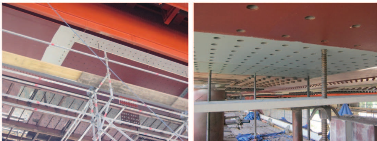
Figure 2: Reconstruction of the „Gazela“ bridge in Belgrade – implementation of zinc-silicate coating „Resist 86“ as anti-corrosive protection of friction surfaces [09]