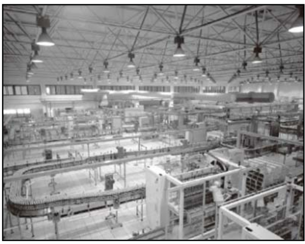
Figure 1: Machines in the production process [07]

we produce and consume. Machines in the manufacturing process must support more features and the human factor must be trained to adapt for market needs. On Figure 1 workers must to prepare for new techniques and working procedures.