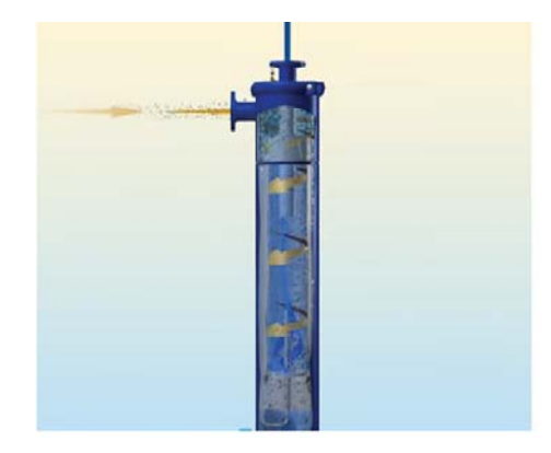
Figure 2: LAKOS eJPX Centrifugal Separator for industrial applications [19]

The figures show that the fluid flows in both devices look similar.